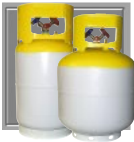
Tanks 30 or 50lbs