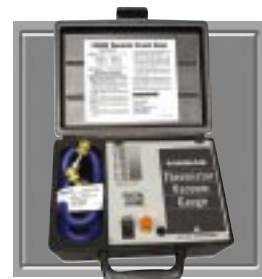
Thermistor Vacuum Gauge