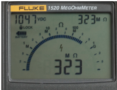
Sample new equipment reading.

If the load side resistance values are acceptable then proceed to the next test. If they aren't, then start tracing the problem: is the insulation breakdown in the load side of the starter, the cables, or the motor?