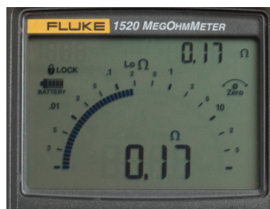
Sample low resistance reading.

Note: Different companies have different threshold minimums for insulation resistance on used equipment, ranging from 1 to 10 megohms. Resistance on new equipment should test much higher—from 100 to 200 megohms.