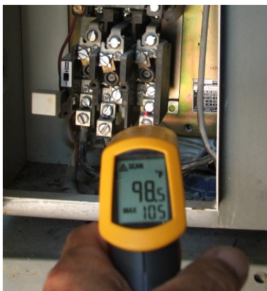
Figure 1: Using the Fluke 62 Infrared Thermometer during predictive maintenance to check motor lugs at a water plant.

Compared to the hand-cranking with the old insulation resistance tester he finds the one-button test feature on the combo-tool’s remote probe a real convenience.