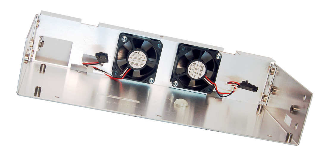
Figure 3: Fan and main chassis